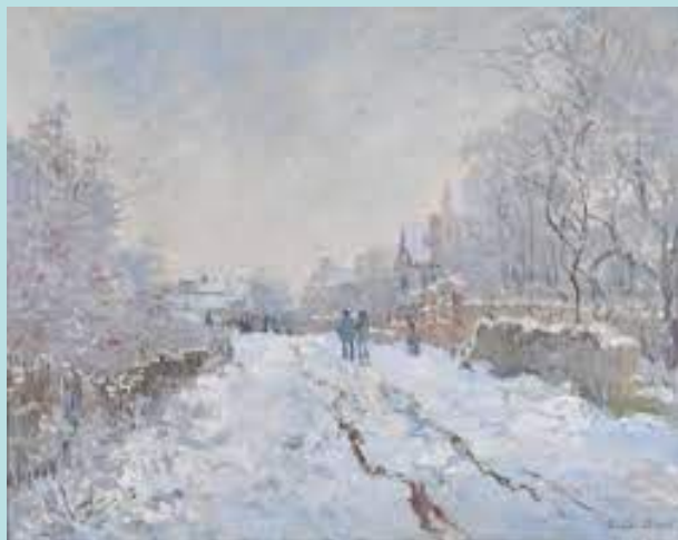
"Snow at Argenteuil" by Claude Monet