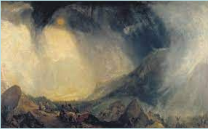
“Snow Storm: Hannibal and His Army Crossing the Alps” by J.M.W. Turner