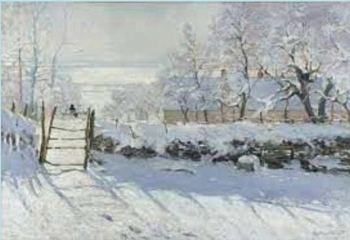
"The Magpie" by Claude Monet

Below, and continuing onto the next page, is a collection of famous paintings from artists known around the world. All of the paintings show how beautiful winter can be! Take a look and admire the beautiful art!