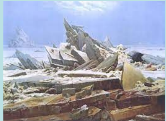
"The Sea of Ice" by Caspar David Friedrich