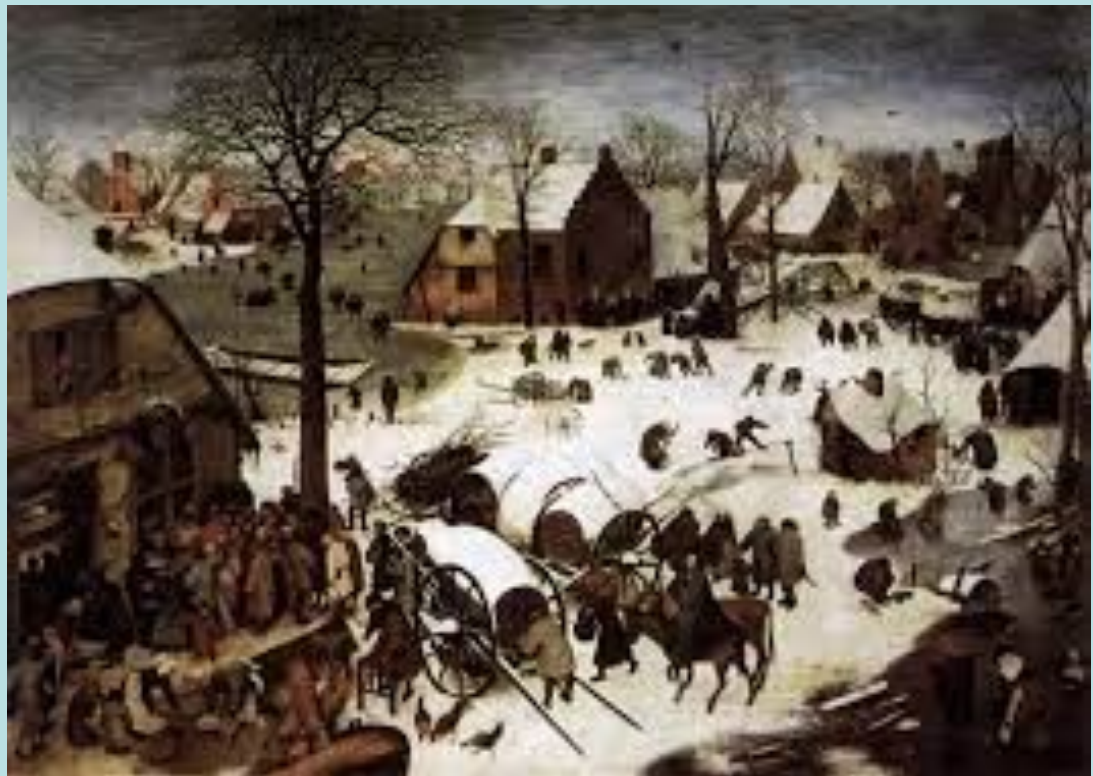
“The Census at Bethlehem” by Pieter Bruegel the Elder