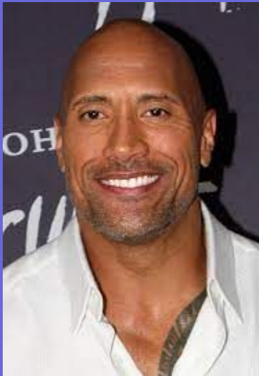
Dwayne "The Rock" Johnson: May 2, 1972