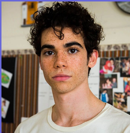
Cameron Boyce: May 28, 1999