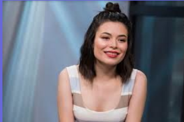
Miranda Cosgrove: May 14, 1993