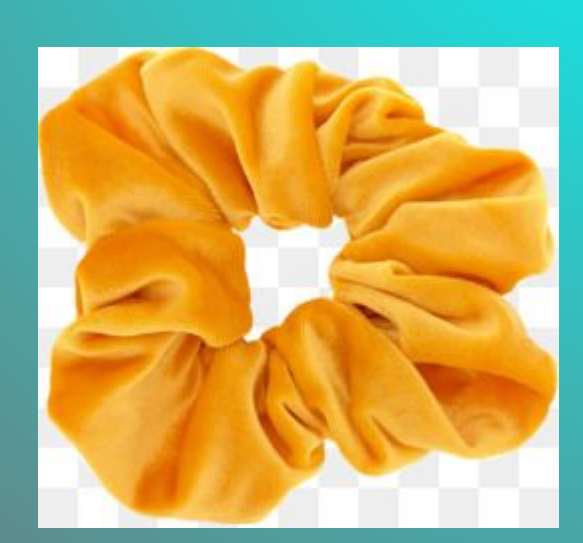
By: Sydney Loeffler

According to the slang dictionary Vsco girl is an insult to teens for using the Vsco app to edit their photos. Another site refers to vsco girls as a lifestyle full of scrunchies, Birkenstocks, and oversized T-shirts. They say "Sksksksk" a lot and also," And I oop."